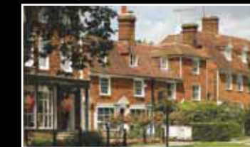
HISTORY AND HERITAGE