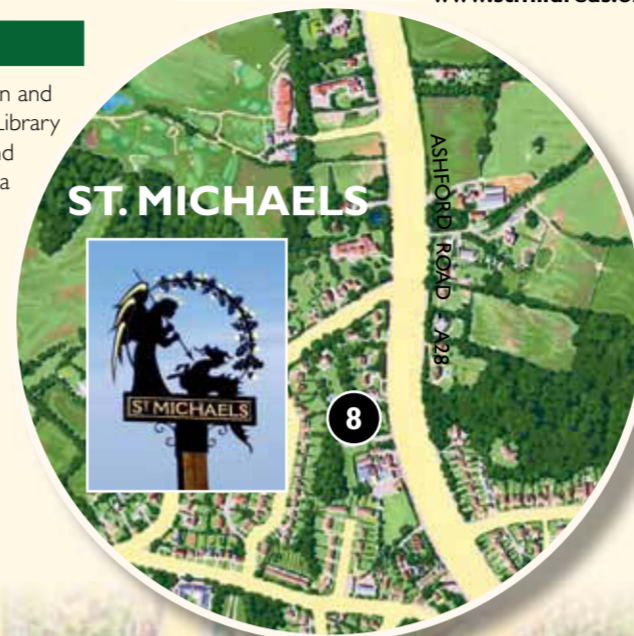
Tenterden Town map reproduced courtesy of the Weald of Kent Protection Society.

Consecrated in 1863 as St Michael and All Angels, the church was constructed of Kentish ragstone and Bath Stone by tradesmen from the nearby village of Woodchurch. The local area took its name from the church having previously been known as Boresisle. www.stmildreds.org