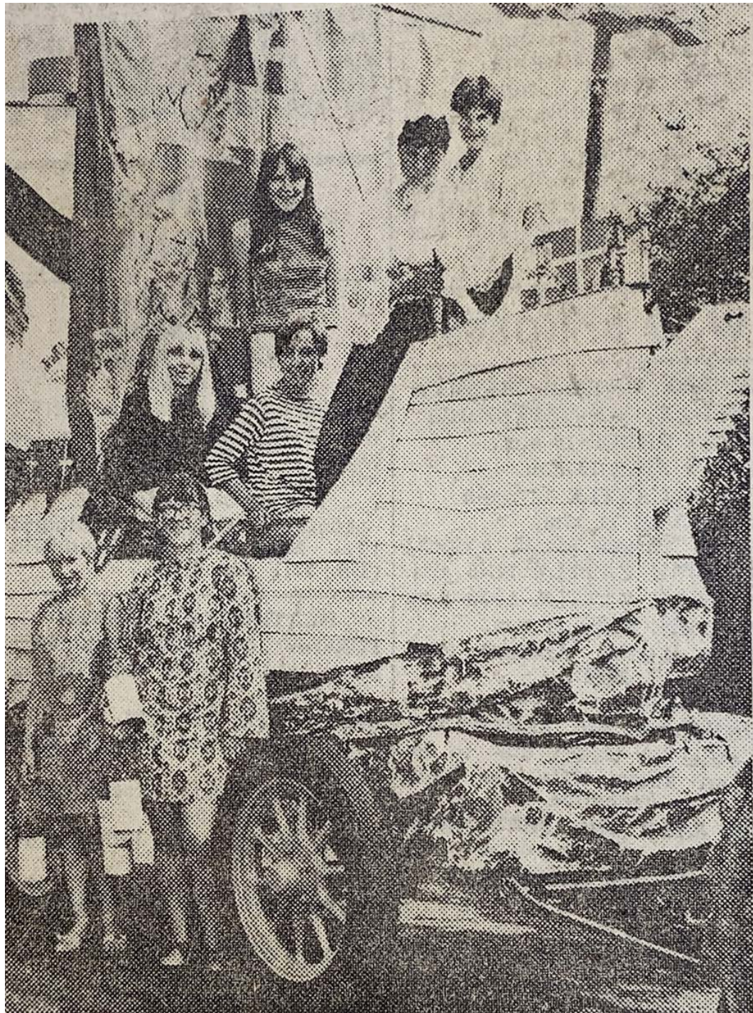
ONE OF THE Tenterden Youth Club entries in Monday's Gala Day procession